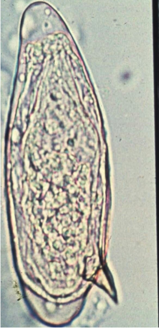
S. mansoni Stool