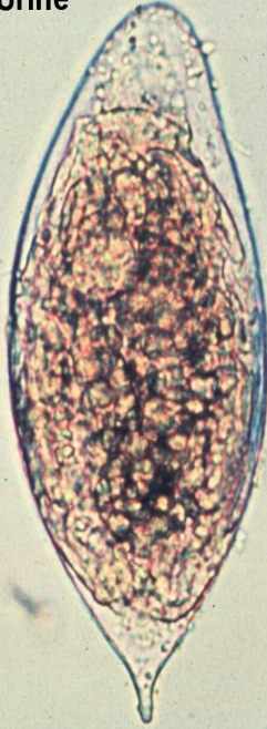
S. haematobium Urine